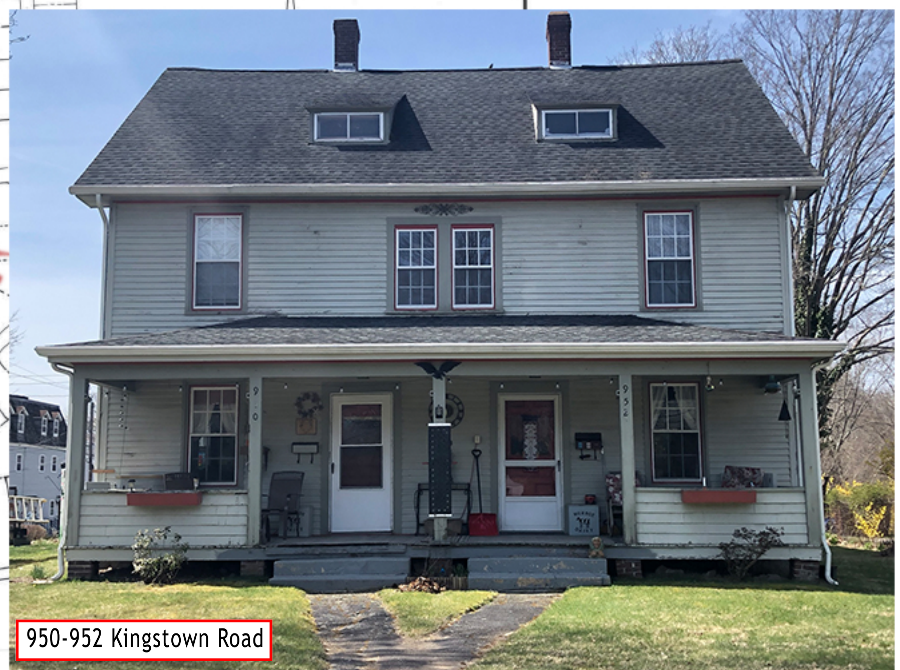
950-952 Kingstown Road

(52) 49-4/66 560 Kingstown Road, the J. H. Brown House (c. 1865): Flank-gable, 2-1/2-story, clapboard tenement; hip-roofed front porch; 4-bay facade with twin entrances; 2 small shed dormers. (C)