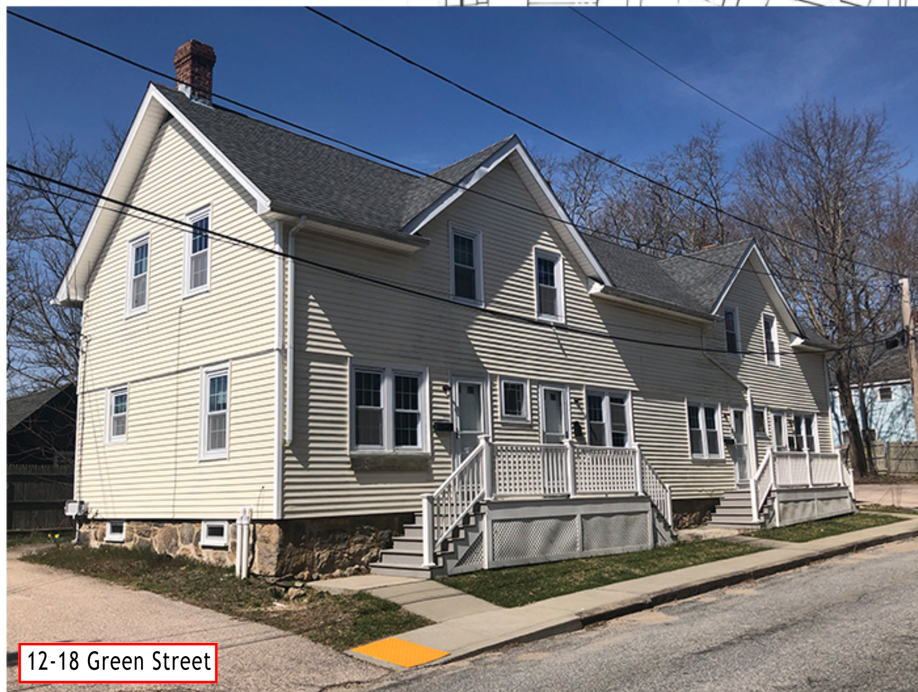
12-18 Green Street

(52) 49-4/66 560 Kingstown Road, the J. H. Brown House (c. 1865): Flank-gable, 2-1/2-story, clapboard tenement; hip-roofed front porch; 4-bay facade with twin entrances; 2 small shed dormers. (C)