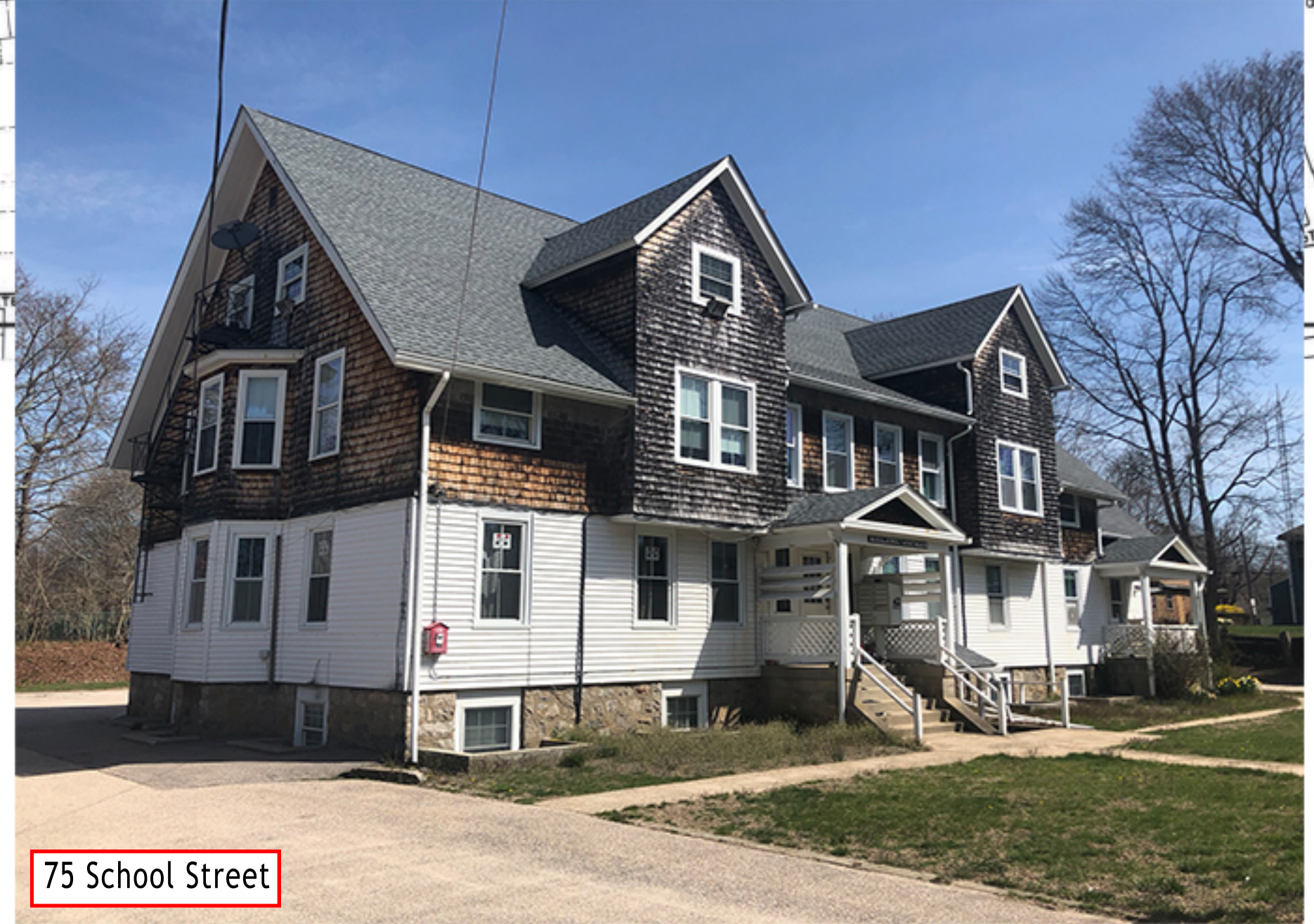
75 School Street

(26) 49-1/148 8-14 Green Street (c. 1900): Standing on the site of Joseph Hazard's mill pond, this 4-unit row house was erected by the Peace Dale Manufacturing Company. The 1-1/2-story flank-gable building is accented by two cross gables. (C)