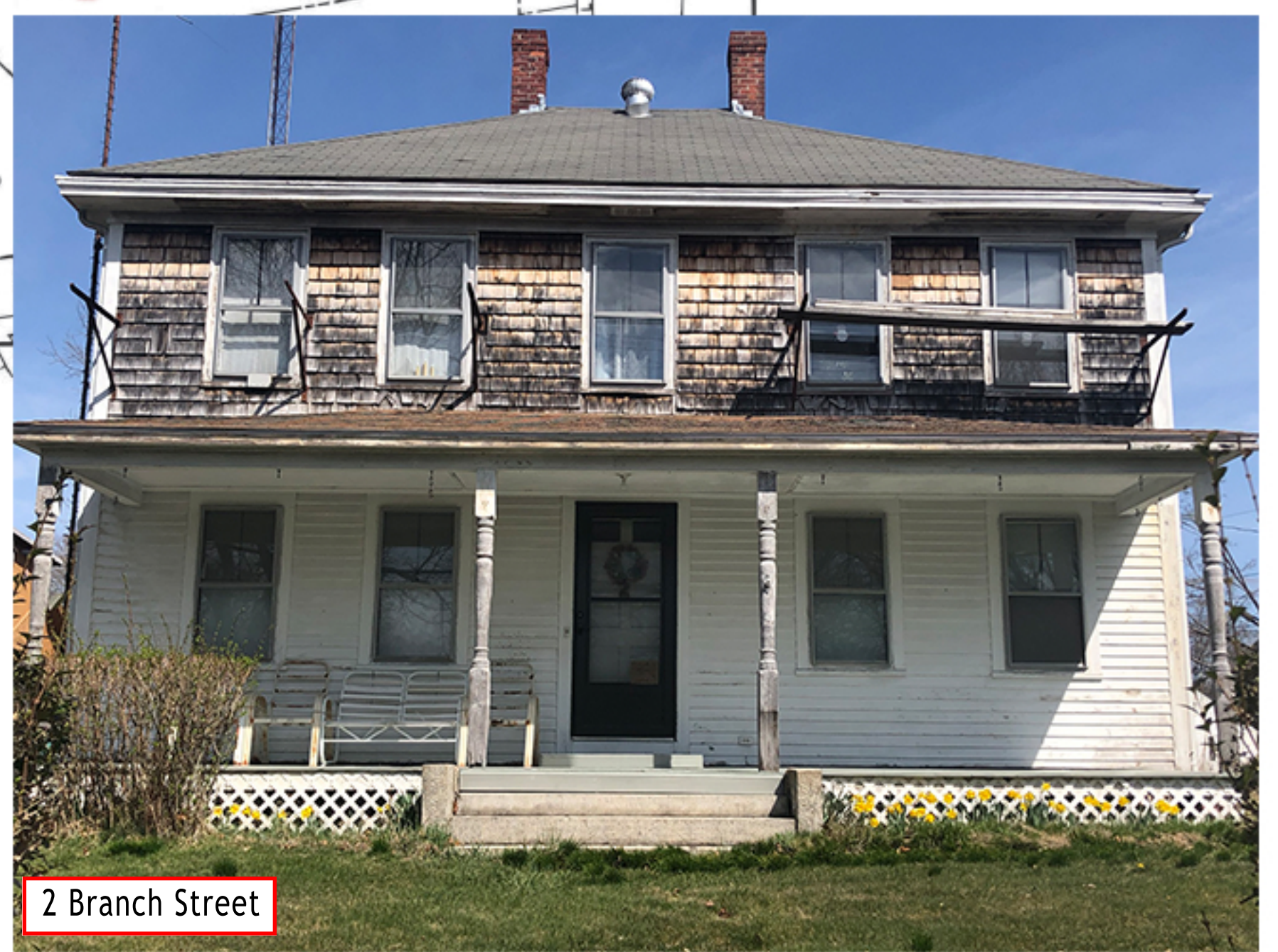
2 Branch Street

(159) 57-1/120 38-40 School Street, former South Kingstown High School, now the School Street Apartments (c. 1880/c1915): Originally much smaller and built as a high school at the corner of School Street and Columbia Street, the building was moved here when the Hazard School was built to replace it (see #115). As altered for apartment use, the building is a 2-1/2-story, flank-gable structure with cross-gable oriels. It has a high stone basement, aluminum clapboard on the first story, and wood shingle above. (C)