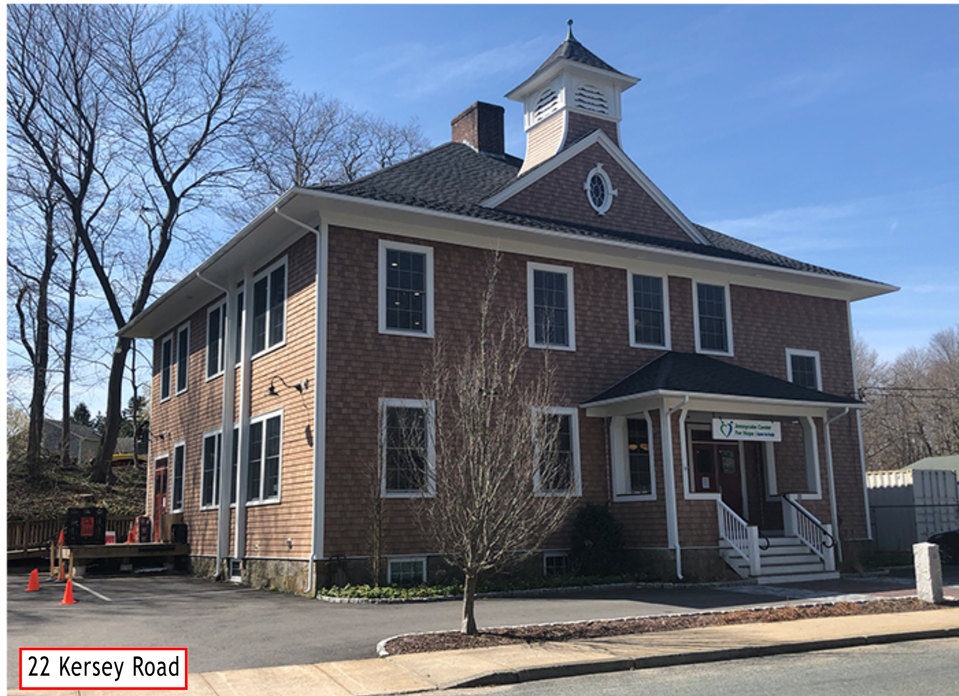
22 Kersey Road

(12) 49-1/129 8 Kersey Road, former Peace Dale Grammar School (1902): Attributed to architect Frank Angell, this 2-story, shingled schoolhouse displays his characteristic design sophistication as well as cognate details like the high hip roof with "kicked-out" eaves and the suppression of any elaboration of window openings. Unassuming yet somehow imposing, a cross-gable on the building's roof carries a louvered belfry. There is a very simple hip-roofed entrance porch with shingled piers. On each side elevation the banks of classroom windows are articulated by curious pilasters flanking the central window. Despite the fact that this building is out of Town ownership and now is used largely for storage, it remains handsome and well preserved, a fine and now rare example of a once common building type. (C)