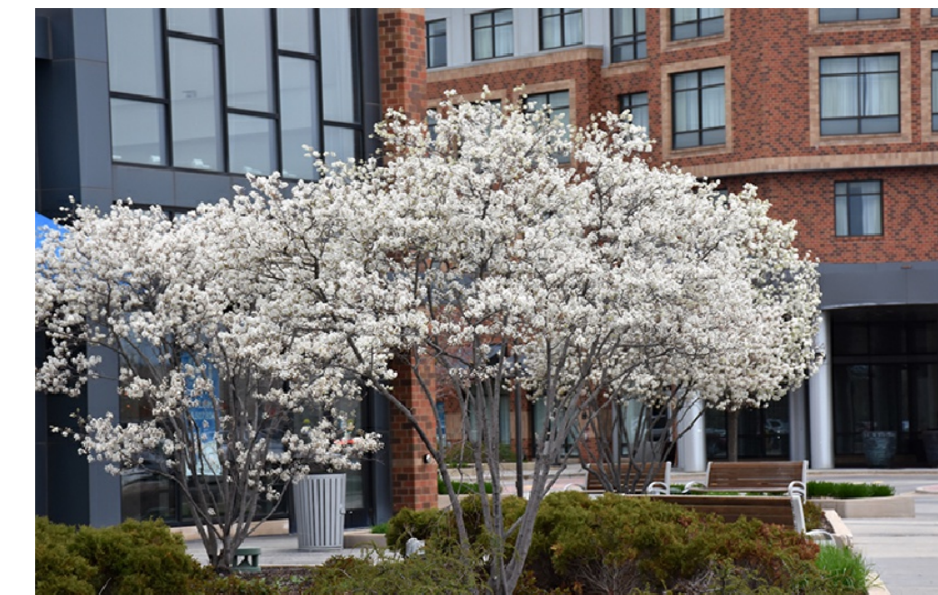
AMELANCHIER 'AUTUMN BRILLIANCE'

WALL MOUNTED LIGHT: Hinkley Forge Outdoor Barn Wall Light 17 1/2" high X 16" wide Extends 32 1/2" from wall 14W E26 Standard-medium LED bulb 120V