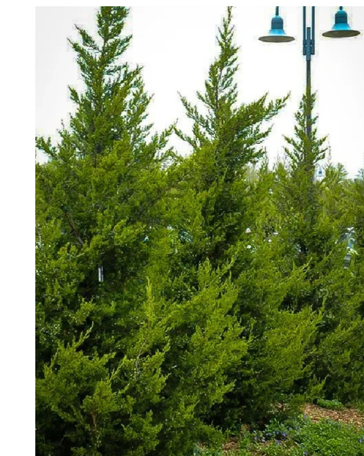
JUNIPERUS 'HETZII COLUMNARIS'