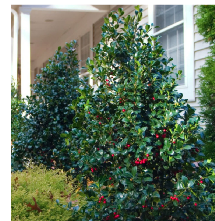
ILEX 'CASTLE SPIRE'