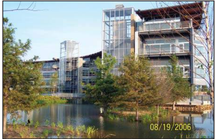
By using native landscaping around its parking lot, Heifer International supports the local ecosystem and conserves water.

Because Heifer used a combination of native seeding and sod, their parking lot requires less irrigation than a conventional lot using all sod and non-native landscaping. In a typical, non-drought year, Heifer's closed loop stormwater system will provide 100 percent of the water necessary to irrigate vegetation throughout the lot, eliminating use of municipal water for this purpose. Heifer uses approximately 5,000 gallons of irrigation water per week, or 260,000 gallons annually, to irrigate its grounds. According to their landscape architect, this represents a two-