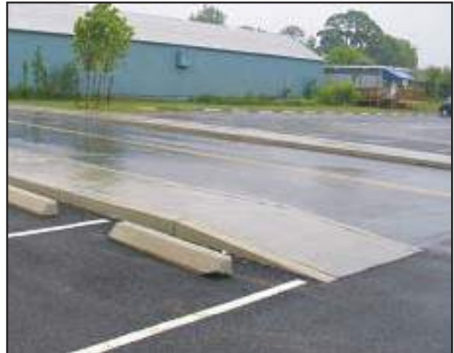
Rainwater infiltrates the porous asphalt (left), but accumulates on adjacent road paved with conventional material (right).

In addition, project managers were also interested in avoiding any potential impacts to groundwater supplies. 127 The University determined that a permeable asphalt surface would help control runoff quantities as well as potentially limit pollutants entering surface and groundwater supplies.