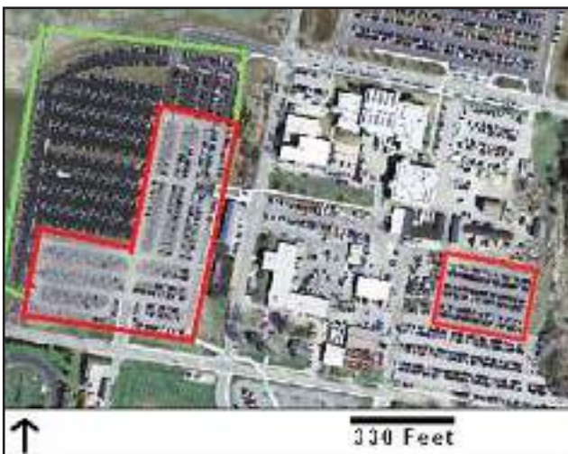
URI's permeable parking lots - The two original permeable asphalt parking lots built in 2002 and 2003 are outlined in red. The 2005 parking lot extension is outlined in green.

In 2002 and 2003, the University of Rhode Island (URI) constructed two parking lots at their Kingston, Rhode Island campus to meet parking demands from new University development and commuting students. The parking lots were located within the town's groundwater protection overlay district, the University's wellhead protection area, and also within the Pawcatuck sole source aquifer. These lots would increase parking capacity by 1,000 spaces, spread over seven acres of land (see areas highlighted in red in Photo 1). However, because the lots were located in an ecologically sensitive area already covered by an estimated thirty percent impervious surface, the University desired an environmentally protective option than would combat stormwater issues more effectively than conventional paving surfaces. The University's main stormwater concern was to decrease runoff quantities to protect a nearby stream considered impaired due to low water flows.