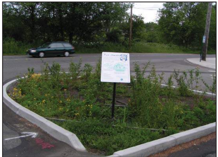
The raingarden in Bloedel Donovan Park helps protect the water quality in nearby Lake Whatcom, and recharge groundwater supplies.

of drain rock, and topped with a layer of fabric to constrain the sand and restrict any plants from growing through. An 18- to 24-inch layer of sand composed of twenty percent organic materials is the top layer .