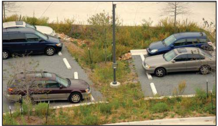
Strategically sloped vegetated strips are a better option than conventional grassy parking islands for collecting and filtering runoff.

Innovative stormwater management strategies are increasingly being incorporated into parking lot design as part of the overarching concept of Low Impact Development (LID). LID stormwater techniques (also known as Best Management Practices, or BMPs) manage stormwater on-site, reducing negative impacts on receiving waters and municipal stormwater management systems, and decreasing the need for costly infrastructure such as pipes, gutters, and curbs. Done on a small-scale, these controls attempt to mimic the pre-development ecological and hydrological processes of an area and can reduce stormwater and site development design, construction, and maintenance costs