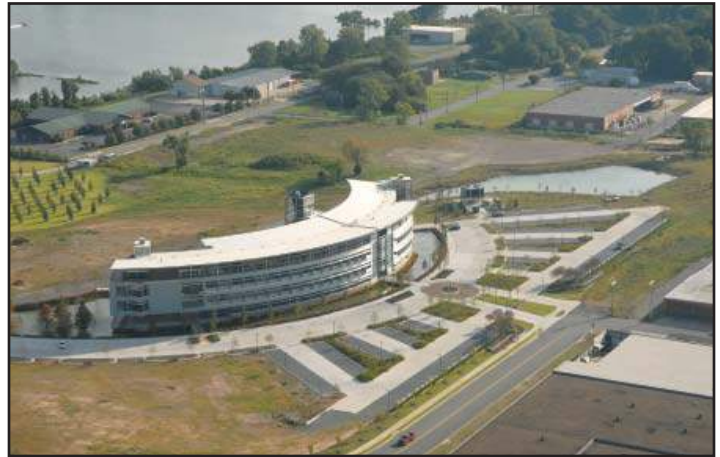
Heifer International's World Headquarters: a green building with a green parking lot.