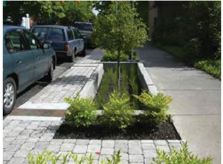
One of many rain gardens being built throughout Portland as part of the city's Green Streets program.

In revamping the Green Streets program, Portland focused on learning through demonstration projects. This includes a project on the Portland State University campus built in 2005 to treat 8,000 square-feet of street