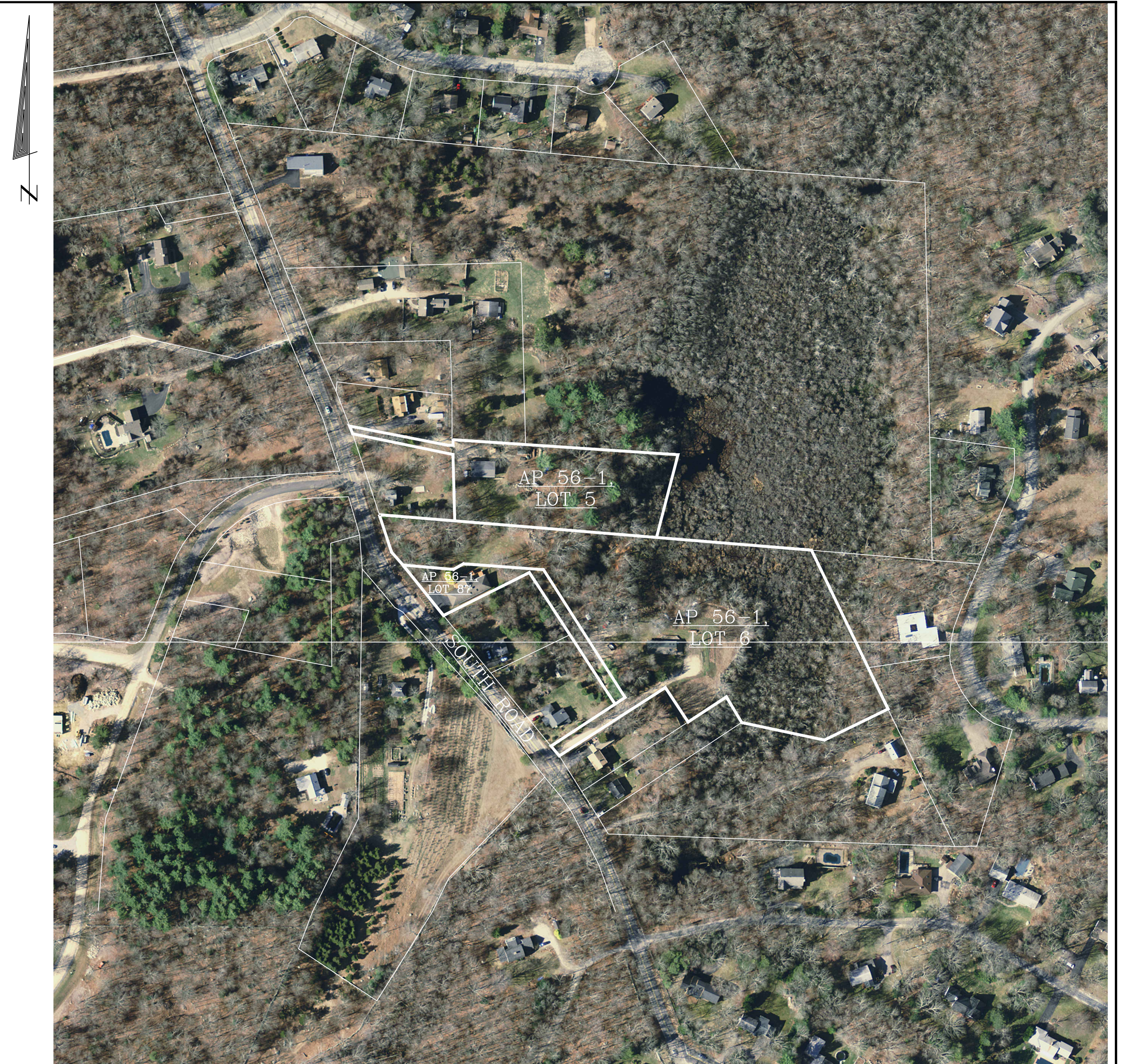
AERIAL LOCUS MAP SCALE 1"=150'